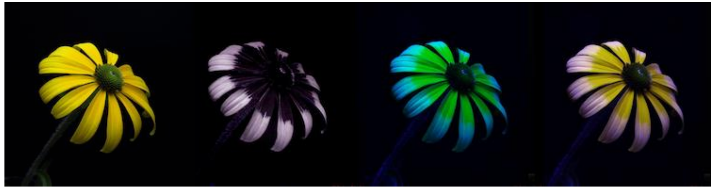
Left to right: The same flower with human vision, UV-only vision (bright = UV), simulated be vision (UV+G+B), and simulated bird vision (tetrachromatcic: UV+R+G+B).

negative impacts. The same light that causes sunburn also forms vitamin D, which is important for bone strength. While we can't see ultraviolet light, some insects, birds, and other animals can. Reindeer use UV light to spot polar bears, which can be hard to see in the normal visible spectrum.